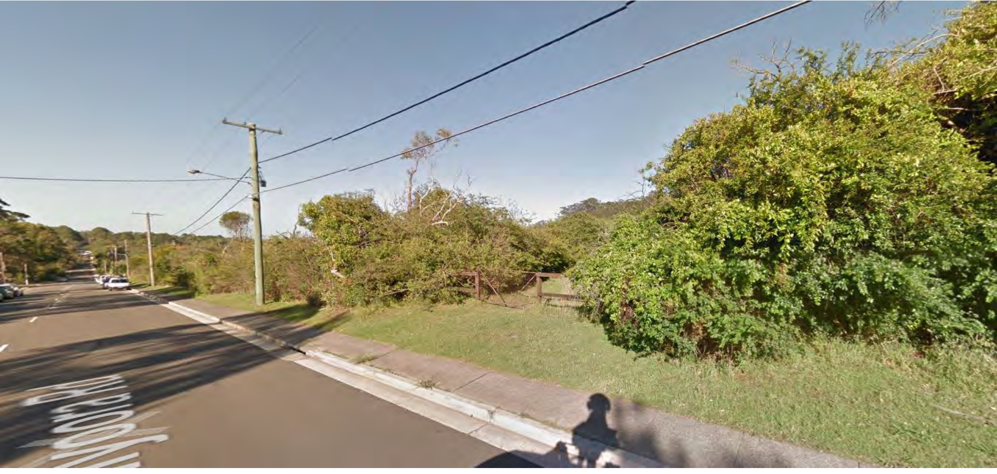
VIEW 2 BEFORE