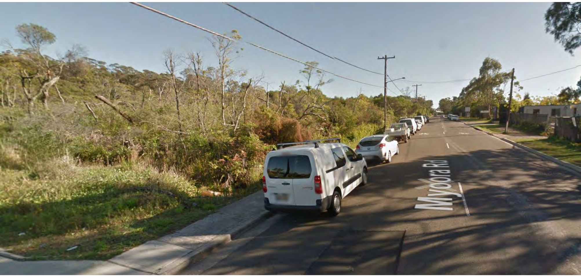
VIEW 1 BEFORE