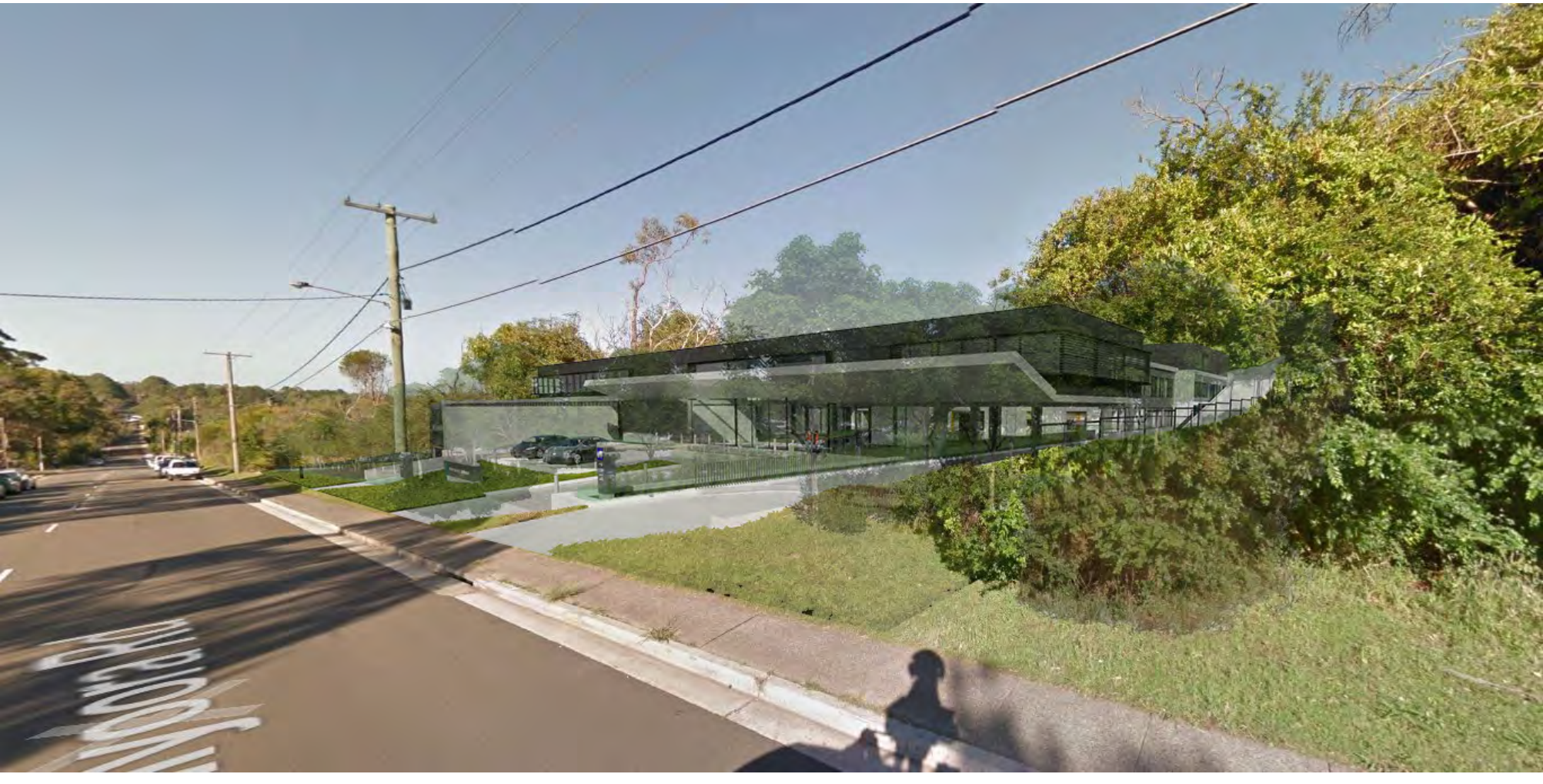
VIEW 2 AFTER