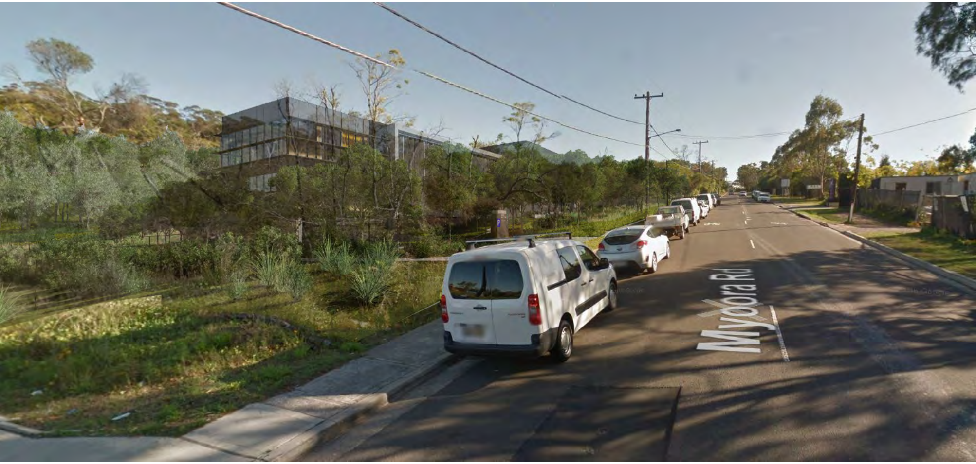
VIEW 1 AFTER